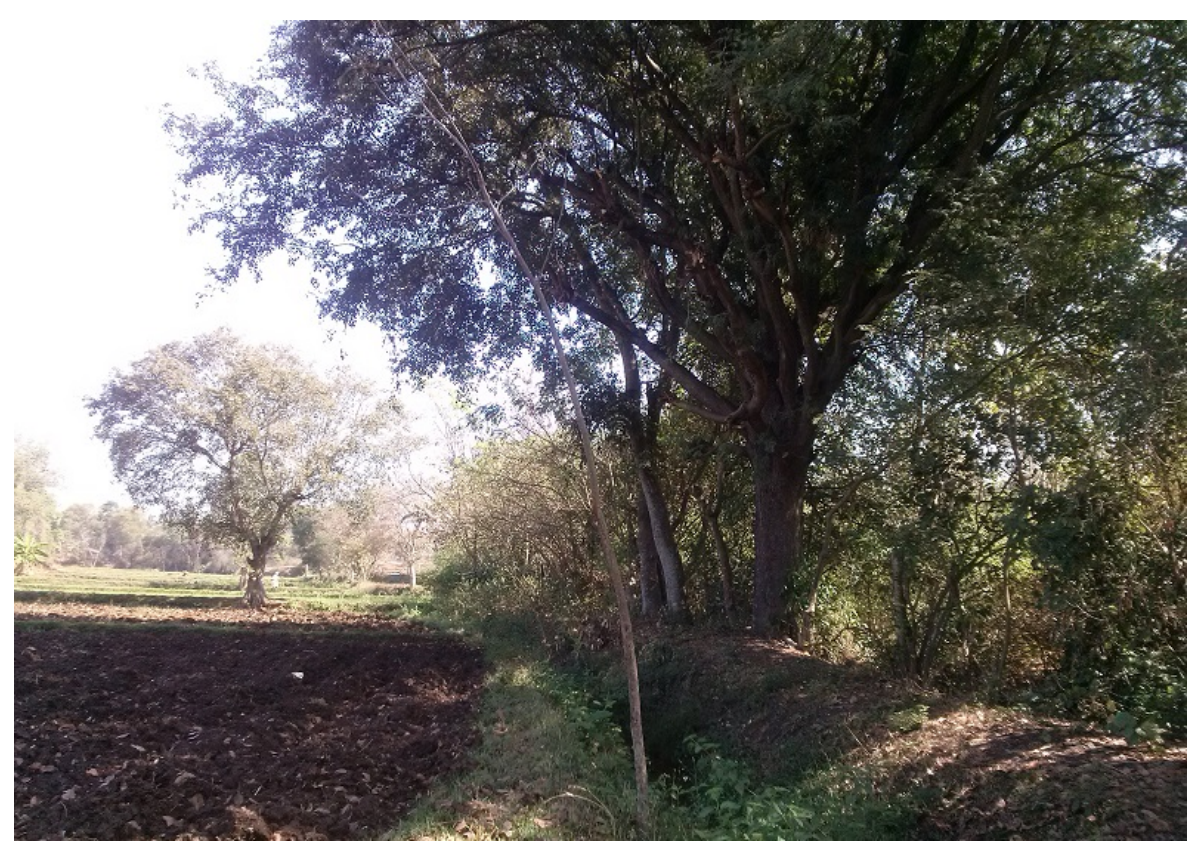
Image 3: The trees' large canopies create shade on the main cropland. According to farmers, this shade as well as the trees' extensive root systems limits the productivity of the main cropland.

Secondly, if biodiesel crops are planted on the bunds around farmers' lands, there is competition with the many other uses such bunds may have. This may be growing fruit or timber trees, grazing or walking to access other people's lands. No one we met throughout this research, except farmers in Hassan district, raised these issues. Additionally, Baka and Bailis (2014) calculated that the Prosopis juliflora currently growing on many lands classified as wasteland actually yields much more energy than Jatropha curcas could do – something which never got registered between 2003 and 2009. Activists did point out that if land is currently used for grazing and firewood collection, then growing biodiesel crops on those lands competes with access to fodder and fuel (e.g. SPWD). Also, there may be competition with biodiversity and wider ecological aims and values if any of the targets on biodiesel